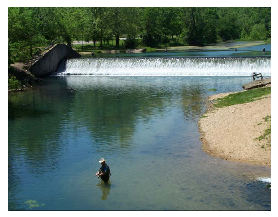
Fishing at Bennett Spring State Park is one of the many Conference activities.