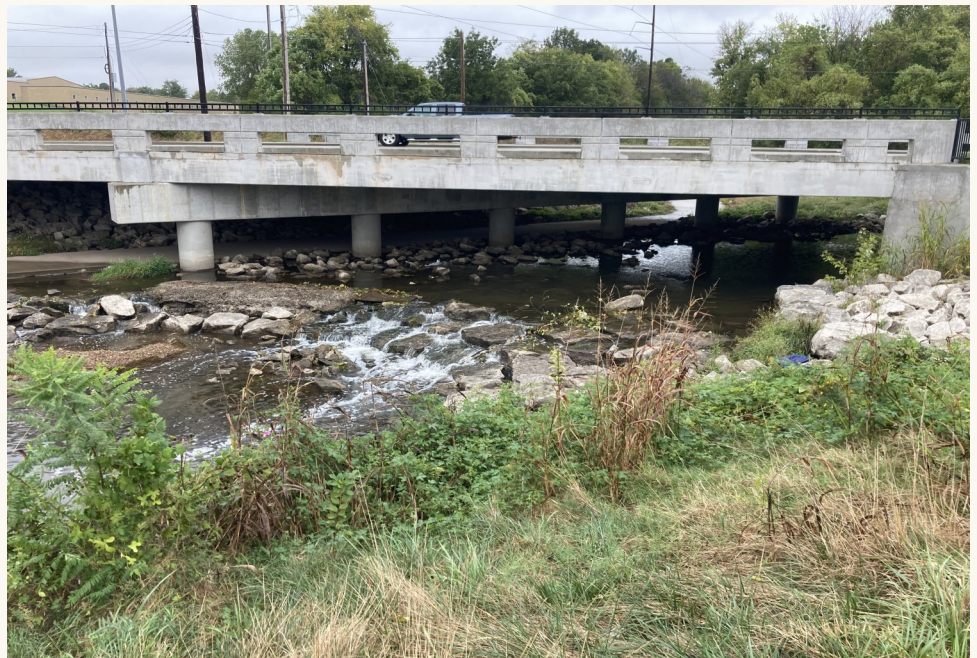
Jordan Creek, Springfield, MO