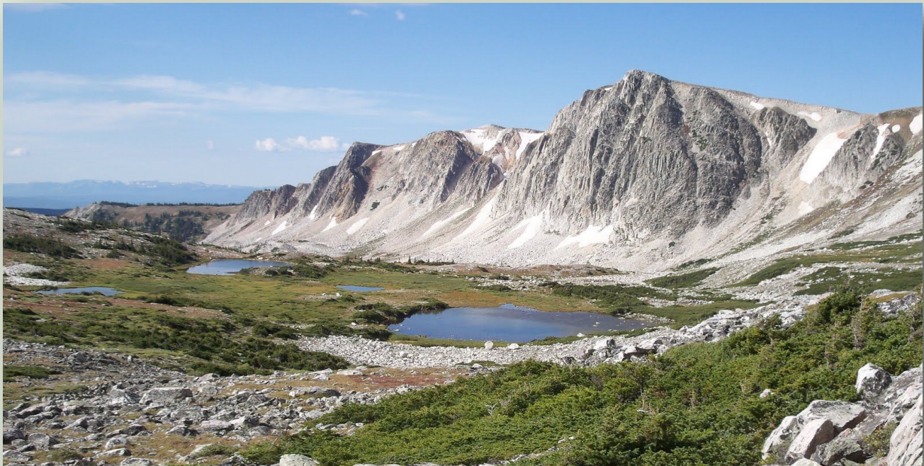
Medicine Bow Peak—Wyoming