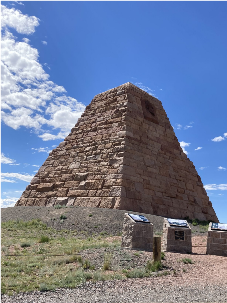
AMES MONUMENT—i-80, Wyoming

SPREAD THE WORD!!! The ACE Conference is an excellent way to network with people from the Forest Service, National Park Service, State Departments of Natural Resources, State Parks, State Game & Fish Departments along with contractors, and vendors involved in the conservation industry.