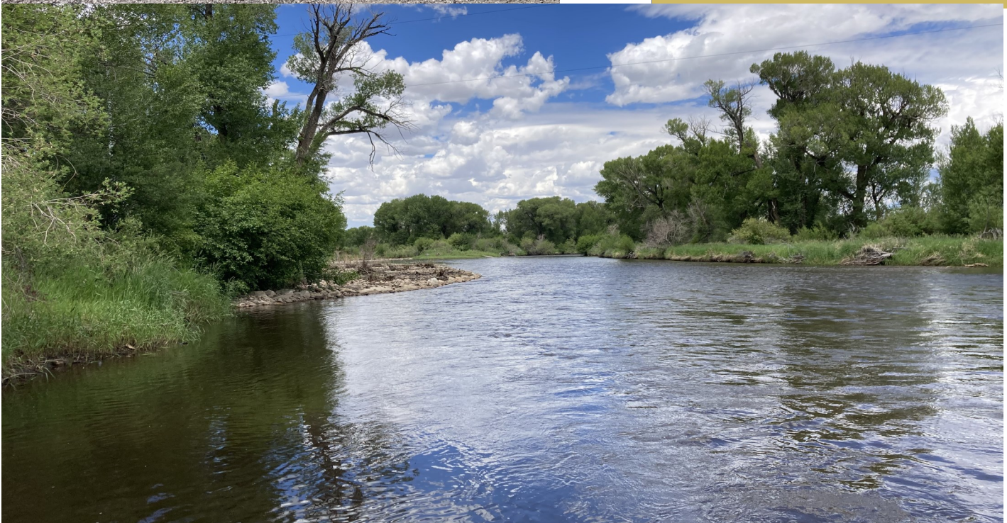
North Platte River—Treasure Island Public Access Area

SPREAD THE WORD!!! The ACE Conference is an excellent way to network with people from the Forest Service, National Park Service, State Departments of Natural Resources, State Parks, State Game & Fish Departments along with contractors, and vendors involved in the conservation industry.