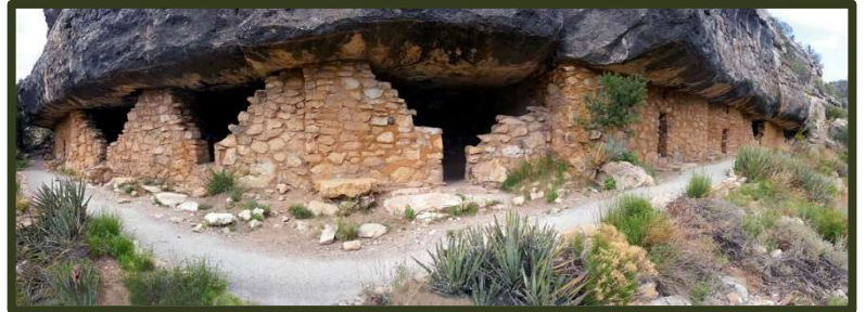
Walnut Canyon National Monument