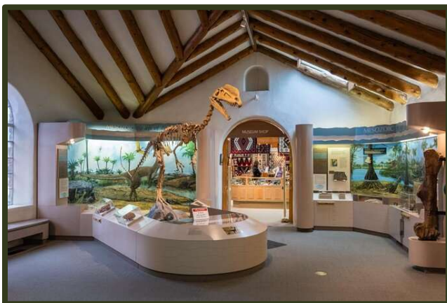
Museum of Northern Arizona