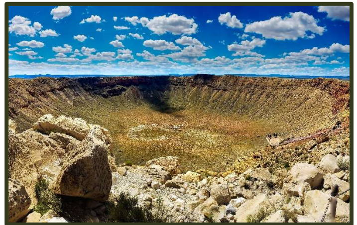
Meteor Crater Natural Landmark