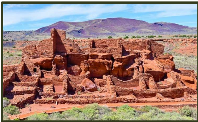
Wupatki National Monument