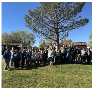
63rd ACE Conference—Flagstaff, AZ October 2024

October 6–10, 2024 / High Country Motor Lodge