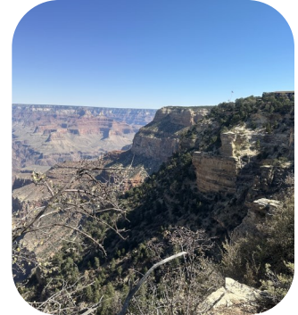
South Rim Grand Canyon—October 2025