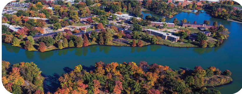
Southern Illinois University, Carbondale, IL